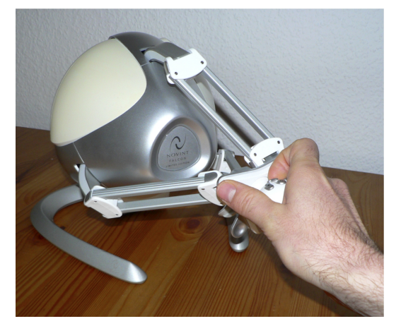
Figure 1. NovInt Falcon haptic force-feedback device.

Figure 1 shows a human hand gripping the Falcon device. It does not look as artistic as we would prefer, but it satisfies our requirements for now, and it operates in three dimensions. It measures position in the XYZ Cartesian coordinate space, and it can exert a force in the Cartesian coordinate space. Furthermore, an open-source driver is a available for the NovInt Falcon for Mac OS, Linux, and Windows, and this driver has been compiled into both Max/MSP and Pure Data (pd) objects, making it easier to access the device for computer music applications [1, 2].