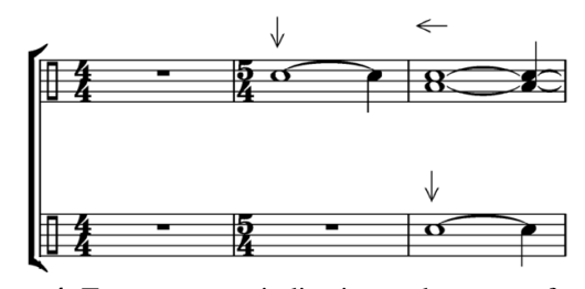
Figure 4 . Top two staves indicating to the two performers when to play which sides.

Consider the engraving section, for which k is small and R is big, resulting in a kind of frictional interaction. Arrows on the score indicate bowing-like gestures to be performed. For example, subject to this interaction, the hypothetical top staff in Figure 4 would specify that the performer should first play a rest for four beats, and then for five beats the performer should slowly push down into the bottom "c" side. Next, the performer should push to the left into the left "a" bar, at a position low enough (see Figure 2) that both the bottom and the left sides will create sound. Similarly, the second staff (see Figure 4, bottom) would indicate that only in the third measure, the second performer should play by gradually pushing into his or her the bottom side.